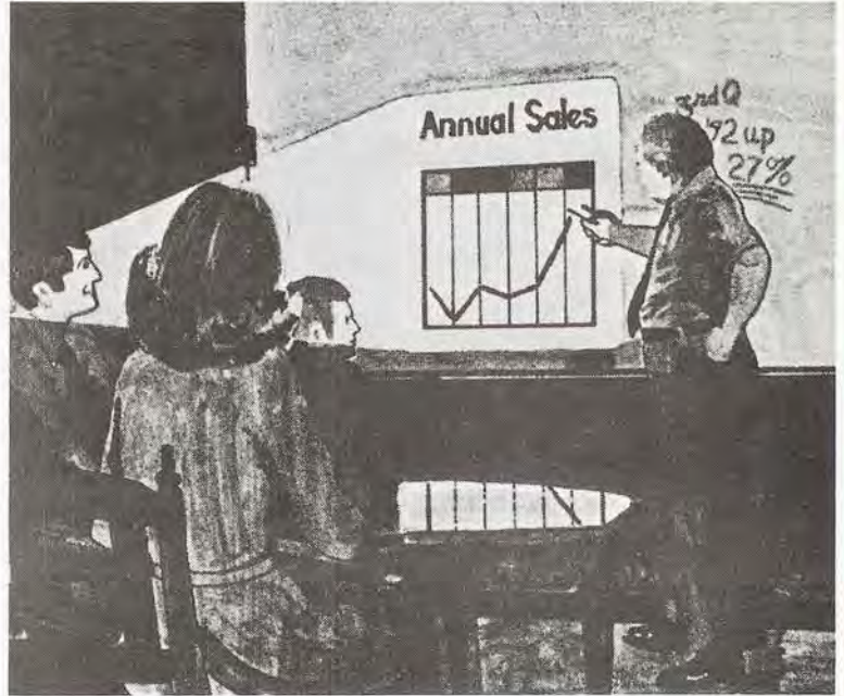
PG 300 White

Panel Graphic can be applied directly over old walls or chalkboards (surfaces must be smooth) or used as an original wall covering. A floor to ceiling Panel Graphic wall also makes an excellent information display surface that gives you greater productive use of your space.